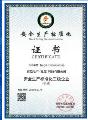
Work safety certificate