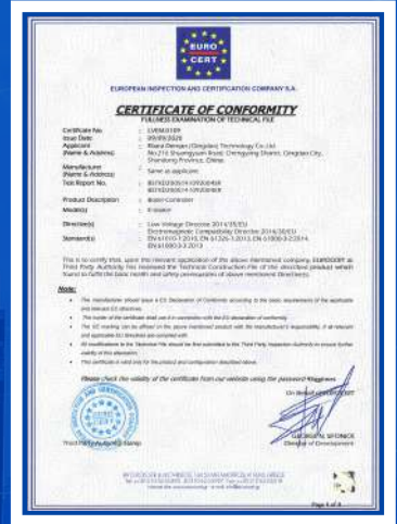
CE certificate of E-istoker