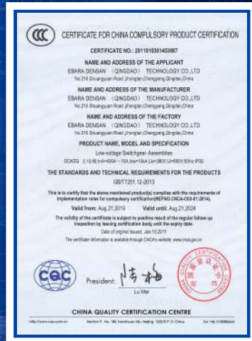
High&Low Voltage Switchgear Certificate